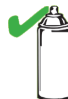
Empty aerosol cans