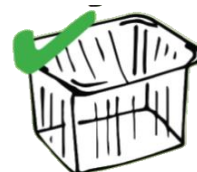
Plastic fruit & vegetable punnets