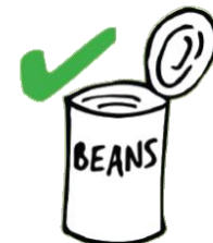
Food & drinks cans & tins