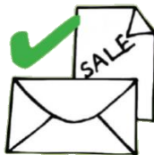
Leaflets, envelopes & junk