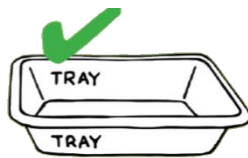
Plastic meat trays