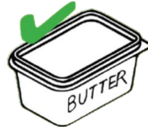
Yoghurt pots & plastic tubs