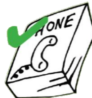
Phone books & yellow pages