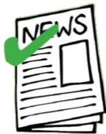
Newspaper & magazines