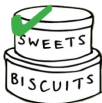
Sweet & biscuit tins