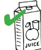
Food & drink cartons