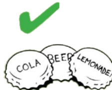
Metal bottle tops & jar lids